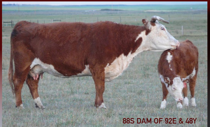
88S DAM OF 92E & 48Y