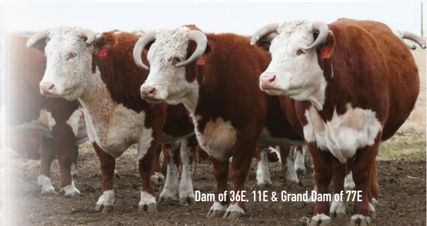
Dam of 36E, 11E & Grand Dam of 77E