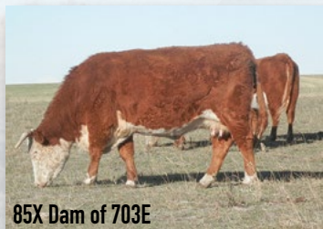
85X Dam of 703E