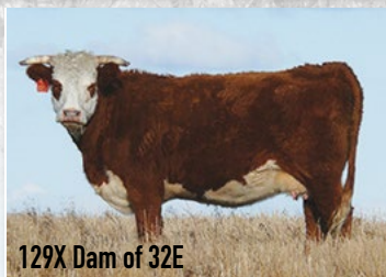
129X Dam of 32E