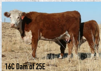
16C Dam of 25E

Last (2-yr-old) but certainly not least, Esquire 124E commands respect - performance (110 WN indx; 106 YR indx), eye-appeal, length & muscle. He's wide-topped with a deep build, hooded eyes, red testicles, red neck & a really nice disposition off proven 18Z. Mom, 120W, herself is tremendous (5 males avg'd 111.2 WN indx, Yr 108.8; 3 females avg'd 110 WN indx, & 103 YR indx for 2), voluminous, easy-fleshing, excellent coat & milk galore. Her 73C son sold for $10K to Sheidaghan Angus, Maple Creek, SK. Get a piece of 124E: REA 1.14 /100 lbs and RFI 107.