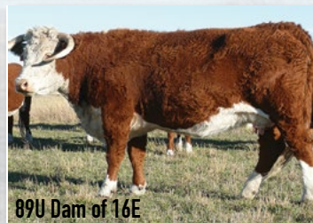
89U Dam of 16E