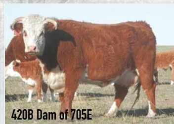
420B Dam of 705E