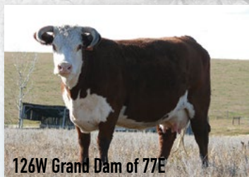
126W Grand Dam of 77E