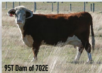
95T Dam of 702E