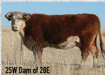
25W Dam of 28E