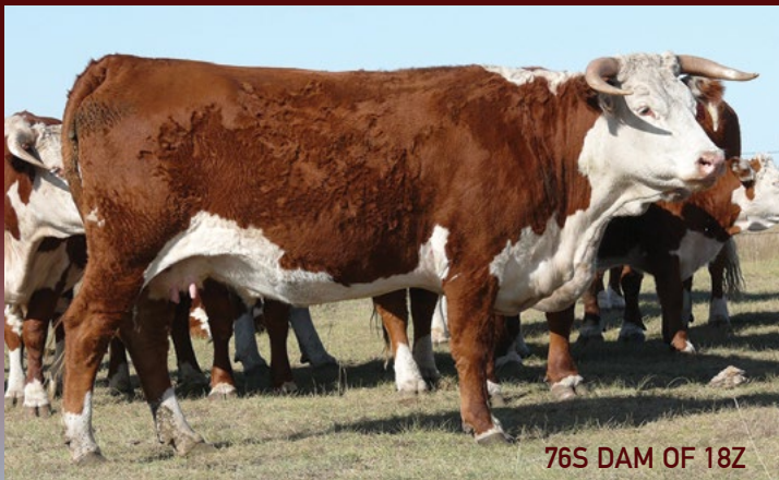
76S DAM OF 18Z

Eye-catching, moderate-framed & powerful, this son of 137A is deep-bodied, full of muscle through quarters into the pants. He's well-marked, with well-shaped red testicles, red neck & throws many red eyes (some goggle). All progeny (mostly from 1st calf heifers) were born unassisted (m avg 78 lbs, f avg 74 lbs BW) then grew, thickening thru YR & beyond! 1stborn to his fantastic dam 78A (her 2 sons avg'd 83 lbs BW, 105.5 WN 103.5 YR indexes; 2 daughters avg'd 85 lbs BW, 111 WN & (1) 115 YR indexes), Chuck's 1st exciting daughters will calve this spring! Lots 25E, 54E, 74E, & 85E