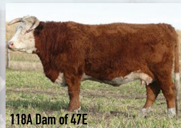
118A Dam of 47E