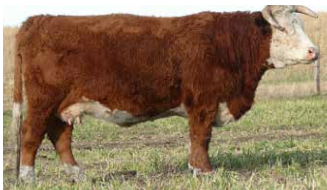
118A - Dam of 12D