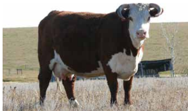
126W - Dam of 89D