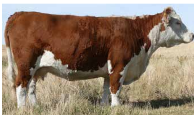
106M - Dam of 125D