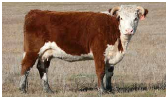
96B - Dam of 129D