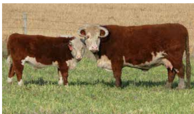
1T and Son 109D