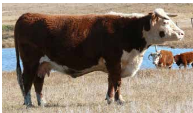
25U - Dam of 105D