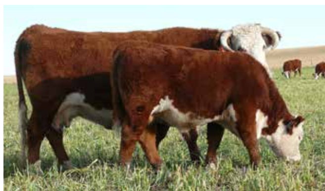
17W - Dam of 43D