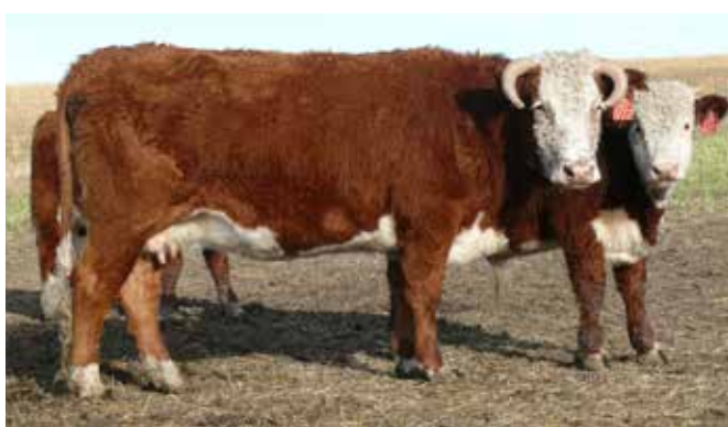
117Z - Dam of 60D

129D will make a great heifer bull - don't miss that 75 lb BW! Although he's got light birthweights built in through both top & bottom of the pedigree, he's an attractive fella, featuring red testicles and hooded eyes (one with 100% pigmentation) while built on a stout structure with excellent feet & legs. You can't accuse 129D's good looks as being just a decoy - the EPDs rank his CE in the top 10% of the breed, BW top 15% and Marbling top 5%, while the ultrasound scanner scored him a 64.9 Lean Meat Yield. Retaining in-herd interest.