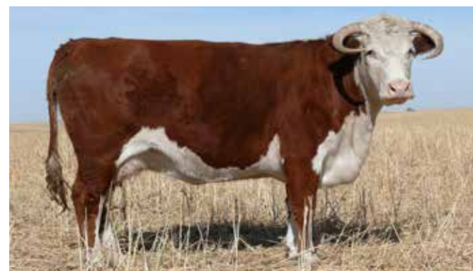
22R - Dam of 604D