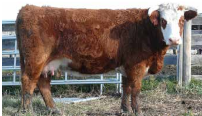
78A - Dam of 41D