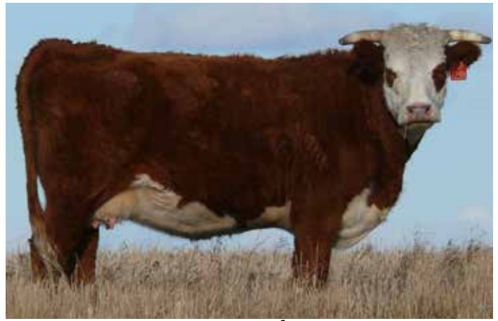
129X - Dam of 87D