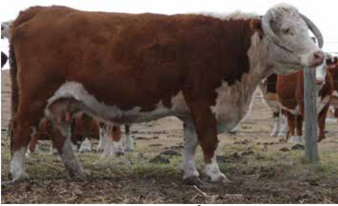
86R - Dam of 85D