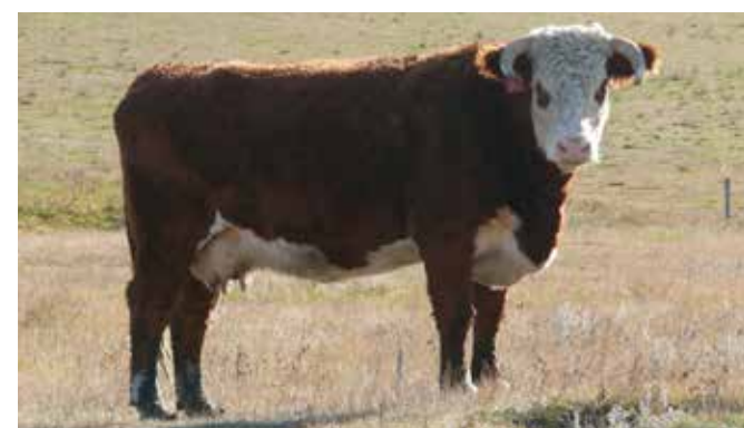
2A - Dam of 6D