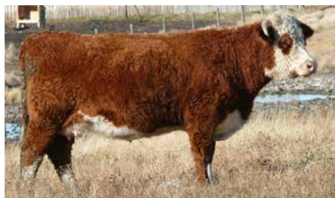
99B - Dam of 76D