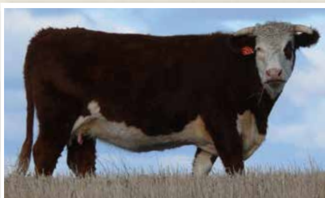
ALNK 27X - Dam of Lot 69C