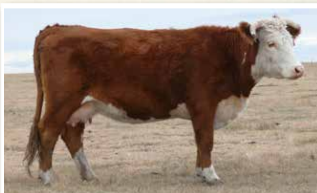
ALNK 144Y – dam of Lot 77