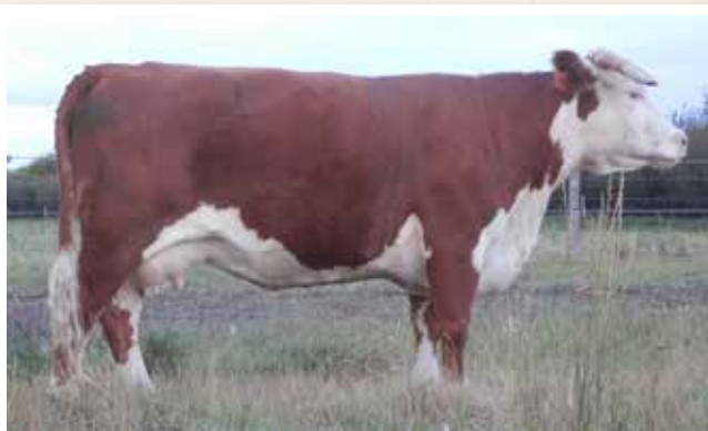
ALNK 22R – dam of Lot 41C

106M is the pretty mama of 138C. She's an embryo transplant with length and extra rib along with correctness. Her record is proving her well by raising 12 bull calves to above average performance at WN (avg 102 WN index) and a daughter that indexed 112 at WN! She's pretty proud of this 138C son of hers too. He's correct, with a curly haircoat, extreme muscling, quarters round and loin wide (compliments of his sire, Pete 203Y) - a stout and a half!