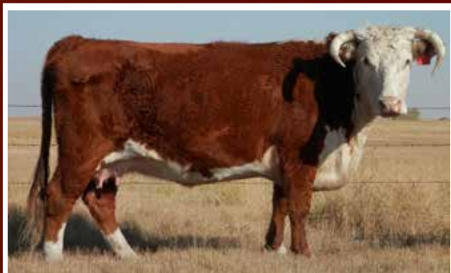
ALNK 62S – dam of ALNK 39A, 37C, & 38C

Top % of Breed for: BW 20%, RFI 5% (Residual Feed Intake) What can he do? Produce thick meaty bulls with pants & wide tops and moderate-sized heifers, deep, sound & easy keeping with great udders. Why? 87W himself has a moderate birthweight, outstanding natural thickness, depth and length, good feet, quarters, & pants, performance, RibEye, Marbling and can pass it on! He multiplies the best attributes of his sire Jack Hammer 26R and his Old Domino 252M dam to produce beef-makers on both sides of a pedigree! Lots 104C & 115C