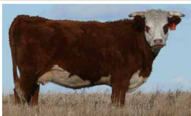
ALNK 129X - dam of Lot 6C