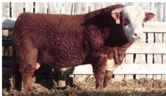
SIRE H: PICTURED AT COMING 2 YEARS OF AGE

Wiley has excellent CE & light BW genetics! Offspring are vigorous at birth, thick, compact & well-marked with excellent pigment. A strong maternal factor is evidenced by his own fantastic feminine mother's (2R) super, flat, tight udder & small teats on each corner. Her consistent calves' avg'd 76 lb BW yet above avg WN. Don't miss 24W's MARB EPD of 0.32, (2014 progeny avg'd 139 MARB index), Lot 112C