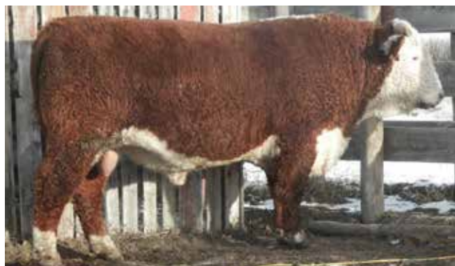
SIRE P: PICTURED AT COMING 2 YEARS OF AGE

Which is more striking? 28Z's two hooded, goggle eyes, red neck, red testicles & red legs down to red hooves, or his eye-appeal, length, thickness & extra-wide top & sound solid feet never trimmed!? All of these traits he passes on to progeny. Check out his 86 lb BW, 109 WN index, REA 1.21/100 lbs, & LMY 66.3! Dam 905W is tremendous with nice even teats on a tight udder. Yes, 28Z has certainly added some Zeal to our herd! Lots 7C, 73C, 103C, 114C, 137C, 501C, & 504C