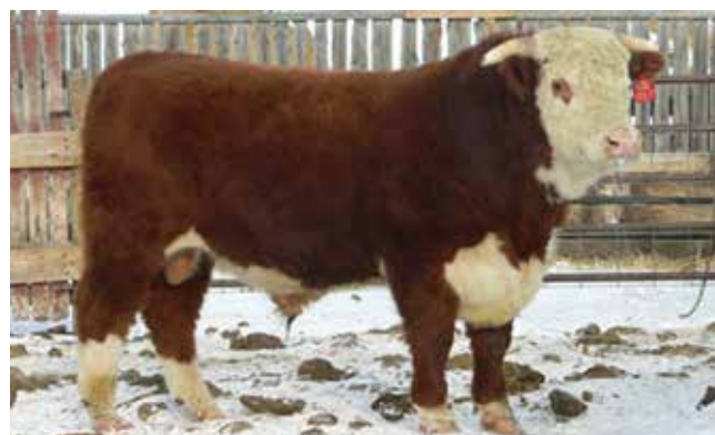
SIRE E: PICTURED AT COMING 2 YEARS OF AGE