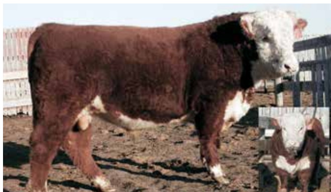
SIRE J: PICTURED AT COMING 2 YEARS OF AGE