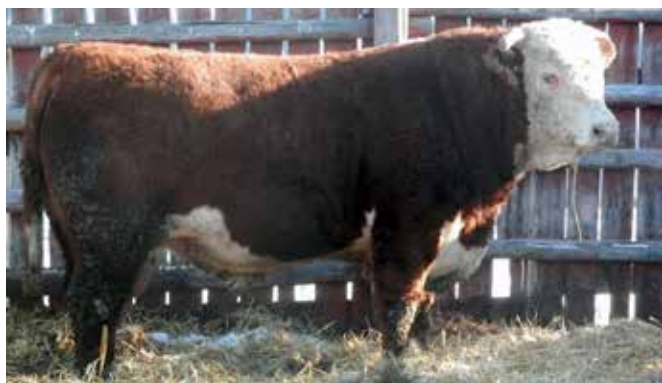
SIRE O: PICTURED AT COMING 2 YEARS OF AGE

This incredible son of 72S has excellent performance (#1 WN, #2 YR with the RFI group), and above avg RFI rounds out his balanced EPDs, plus above avg REA (1.09/100 lbs) & MARB scores. The dam, 62S, raised 5 males: avg 87 lbs BW, avg 120 WN indx (& avg 114.5 YR indx) & 6 hfrs: avg 80 lbs BW, avg 109.3 WN indx (& avg 107 YR indx). With great confirmation, solid feet and a great udder, she backs 39A 100%! We retained 1/2 interest & 1/2 possession when sold to Blaine Hudec, of Jenner AB. Lots 24C, 54C, & 89C